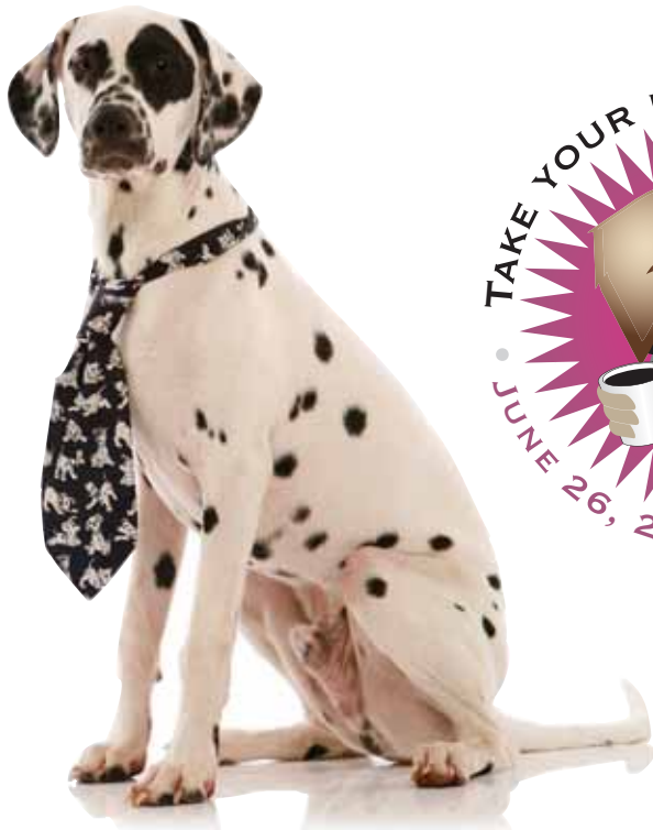
Scooter photo by Animax