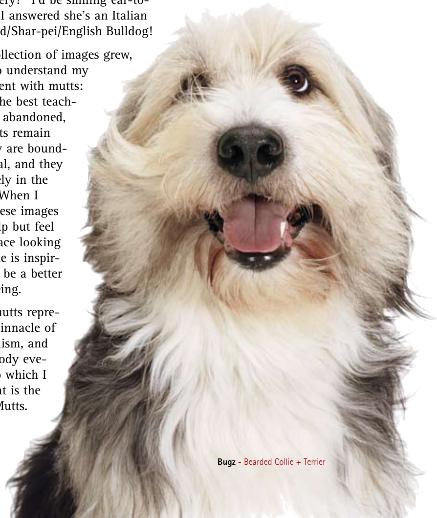
Bugz - Bearded Collie + Terrier