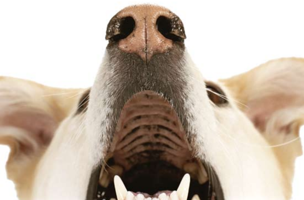
Bailey - Labradore + Collie