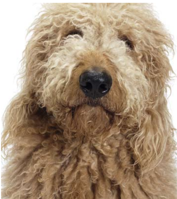
Rupert - Poodle + Labrador