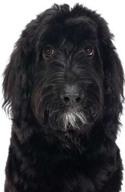
Hailey - Poodle + Labrador