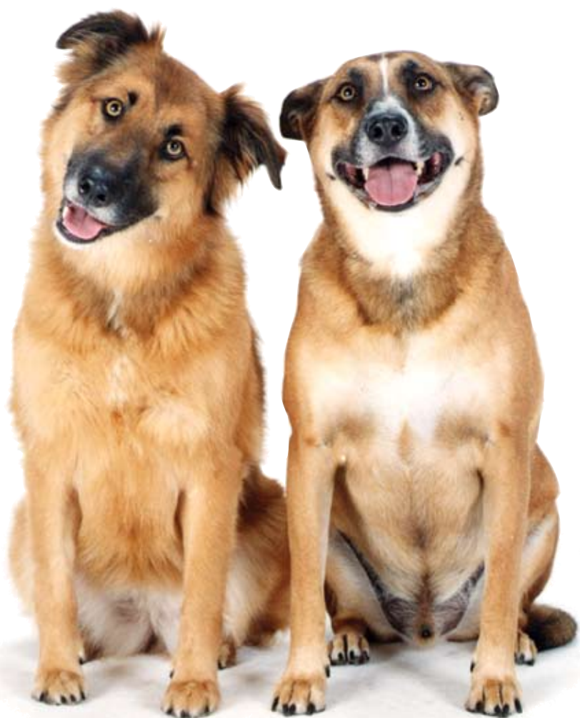
Pebbles & Bam Bam - Collie + German Shepherd + Golden Retriever