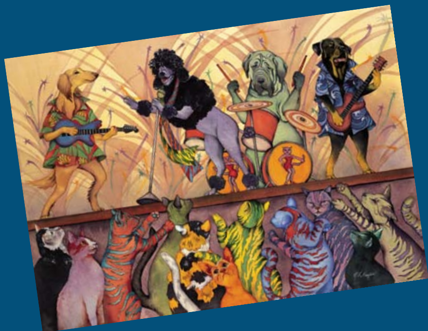
Diggin' That Doggy Rock

An artist that puts the Aloha into Arf and Maui into Meow.