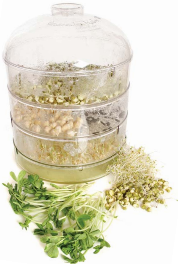
Bio Snacky Sprouter

Take a small feeder bowl and place pinches of mung, adzuki, alfalfa, broccoli, sunflower and chickpea sprouts (or any other combination) in a circle and let the parrots pull it apart.