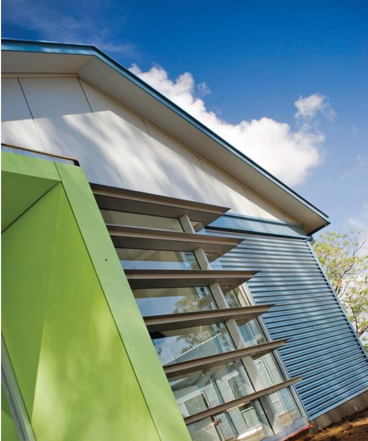
Sydney University Wildlife Health & Conservation Centre